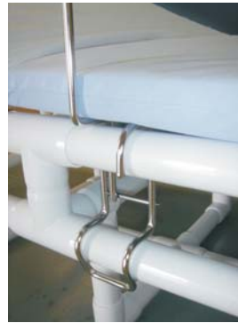
Snap on I.V. Pole