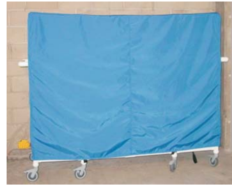
Mobile transport and storage cart with dust cover holds 6 beds.

SPECIFICATIONS: Mattress Length: 80" Mattress Width: 30" Weight Capacity: 650 lbs Bed Height Folded for Storage: 8" In Use: Customer Specific Overall Length: 84" in use Overall Length: 88" folded Overall Width: 36.5" 10 year warranty.