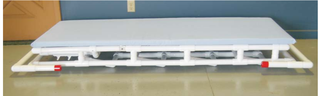
Folds flat for transport and storage and assembles in 20 seconds.

The Shelter Bed has been developed in conjunction with leading experts in the field of disaster preparedness and has been tested in rigorous patient overflow scenerios.